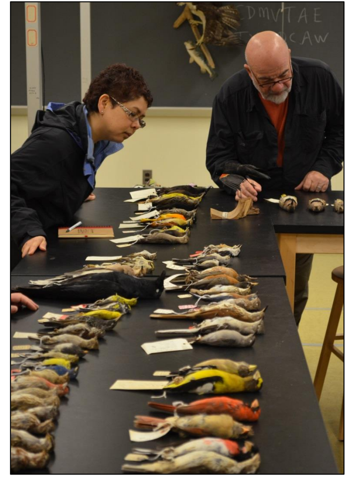
The 26<sup>th</sup> annual Pinelands Short Course featured 35 presentations, including one on birding (shown above).

More than 500 people attended the Short Course. The event included 22 new programs, including a new track of family-friendly courses aimed at instilling a sense of stewardship among younger people. The new courses included presentations on the Pinelands Jetport, Pinelands Lichen Ecology, the Neonate Ecology of the Northern Pine Snake, the Jersey Devil and the Origins of New Jersey, Lost Towns of the Pines, Investigating the Pygmy Forest, the Battle of Chestnut Neck, Wetlands and Hydrologic Gradients, From Tidal Freshwaters to the Ocean: Fishes of the Mullica River - Great Bay Estuary, From the Lens: Learning to Appreciate the Pinelands through Photography, Wilderness Survival Fundamentals, Waste Management/Recycling in the Pinelands, Thomas Wesley Stern Band (live music), Land Use Planning for Barnegat Bay, A Trip Down the Great Egg Harbor River, Birding the Pinelands at Richard Stockton College,