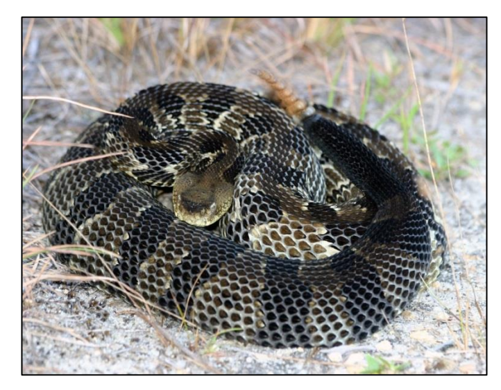
The Commission hosted nine presentations as part of the Pinelands Research Series in 2015, including a talk that focused on timber rattlesnake genetics.

A full listing of previous and upcoming presentations can be found on the Commission's website at: <a href="http://www.nj.gov/pinelands/science/pineseries/">http://www.nj.gov/pinelands/science/pineseries/</a>