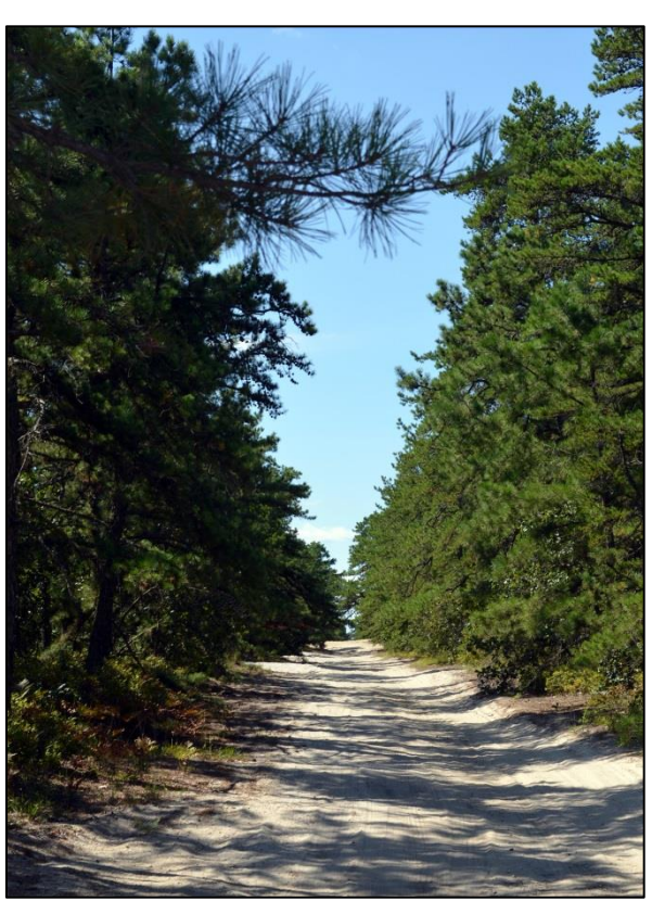
In 2015, the Pinelands Commission helped to preserve the 475-acre Zemel property (above) in Woodland Township, Burlington County.

From 2007 to 2015, the Commission approved the allocation of $10.44 million to 38 projects in the Pinelands Area. Thirty-three of these projects have been completed (as of December 31, 2015), resulting in the permanent protection of 7