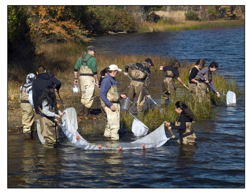
Pinelands Commission staff helped students sample for fish in Batsto Lake during the ninth annual Pinelands-themed World Water Monitoring Challenge.

Staff organized and carried out its ninth annual, Pinelands-themed World Water Monitoring Challenge event. Held at the historic Batsto Village, the event attracted more than 200 students and teachers who gauged Pinelands water quality and learned about the importance of protecting the region's unique natural and historic resources.