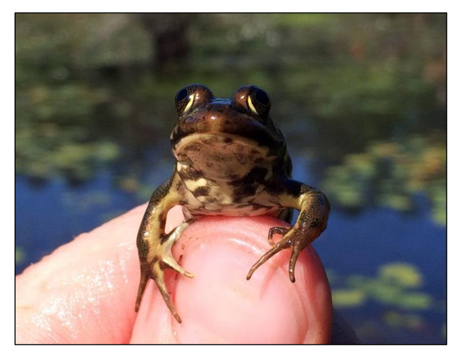
In 2015, Commission scientists completed plant and animal surveys as part of the pond-vulnerability study. This included surveys of native Carpenter frogs.

Commission scientists continued to make progress on a study to characterize the vulnerability of Pinelands ponds to surrounding land uses. Scientists began the first phase of the project by using aerial photography to compile an inventory of approximately 3,000 natural Pinelands ponds. Ninety-nine of these ponds were selected for the study. In 2015, scientists continued to monitor water quality and hydrology at all 99 ponds and completed plant and animal surveys at 24 of the ponds.