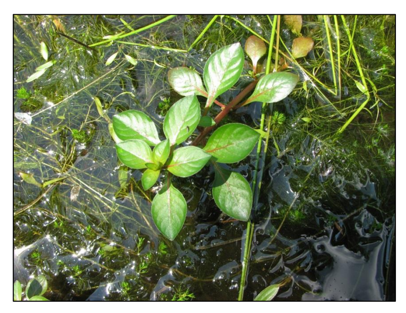
Marsh seedbox ( Ludwigia palustris ) is one of the plants often found in stormwater basins, which are being investigated as part of the Created-wetland Study.

Like natural wetlands, created wetlands can provide the habitat necessary for wetland-dependent plants and animals, especially in human-dominated landscapes where natural wetlands may have been degraded or eliminated. As part of another study, Commission scientists mapped the location of two types of created wetlands commonly found in the Pinelands, shallow excavations that intercept the groundwater (excavated ponds) and excavations designed to receive stormwater (stormwater basins). About 2,000 excavated ponds and 1,700 stormwater basins have been mapped. Fifty-two excavated ponds and 46 stormwater basins were selected for the study.