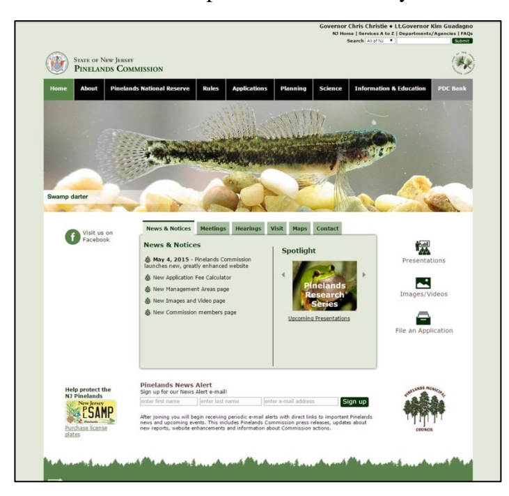
The Commission redesigned its new website to make navigation far simpler and to improve the agency's communications with the public.

The Commission began building the new site, along with designers and programmers from the New Jersey Office of Information Technology, in October 2014. Prior to building the new website, Commission staff conducted an online survey to ask applicants, officials, residents and other members of the public about what they like or dislike about the agency's old site. The