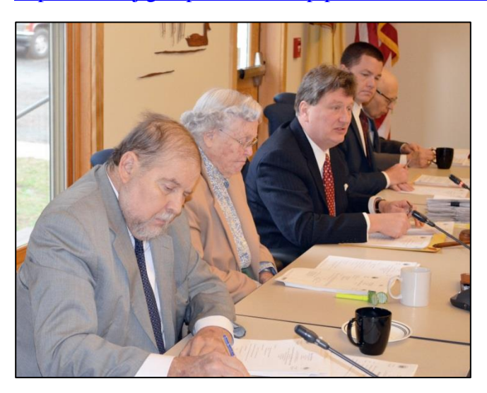
In 2015, the Commission continued to work on several proposed rule changes that were identified during the recent Plan Review process.

The Commission issued The Fourth Progress Report on Plan Implementation in 2014, marking the culmination of the Plan Review process. (The report can be downloaded at: http://www.nj.gov/pinelands/cmp/planreview/PR% 20reports/PlanReviewReportFinalDraft.pdf.)