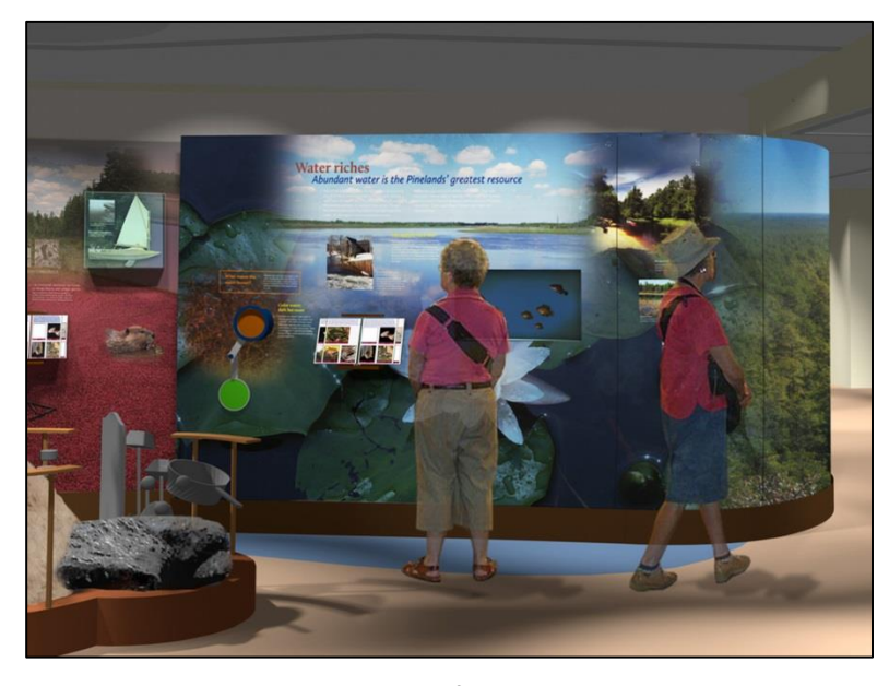
In 2015, the Commission received four bids to build and install Pinelands exhibits (as shown above) as part of the agency's plans to convert a portion of the Richard J. Sullivan Center into a Pinelands Visitor Center.

The Commission received four bids to create and install exhibits in the Richard J. Sullivan Center for Environmental Policy and Education, which is located on 15 Springfield Road in Pemberton, NJ. The Commission posted a Request for Proposals (RFP) on its website on September 2, 2015, and prospective contractors had until October 14, 2015 to submit their